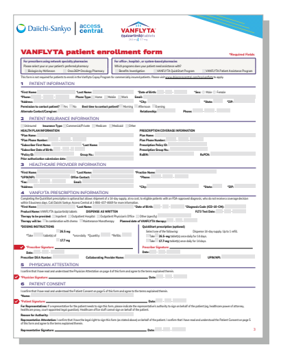
Patient Enrollment Form

*Network specialty pharmacies will accept prescriptions filled out via the Patient Enrollment Form, as well as traditional prescriptions sent separately from the Patient Enrollment Form.